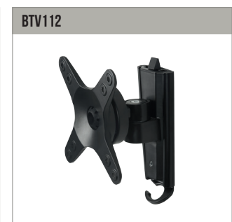
Flat Screen Wall Mount with Tilt & Swivel designed for screens up to 23"