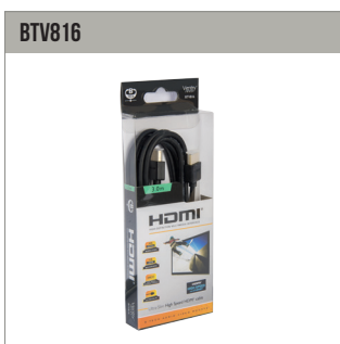
3m Ventry™ High Speed HDMI Cable with Ethernet