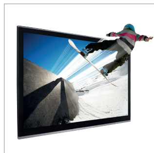
HDMI Cable Ideal for next generation 4K TVs and devices