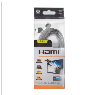
Supplied in stylish Ventry™ packaging with integrated hanging tab