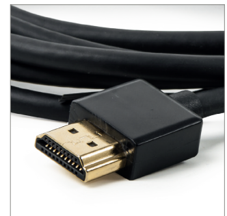
Audio and Ethernet Channels included