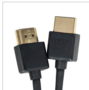
24k gold plated connectors for superior signal transfer