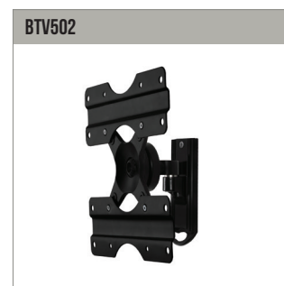
Flat Screen Wall Mount with Tilt & Swivel designed for screens up to 42"