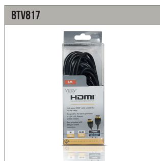
5m Ventry™ High Speed HDMI Cable with Ethernet